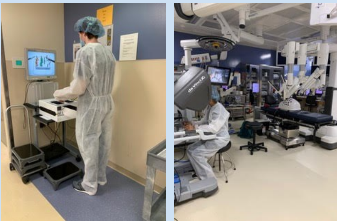
Giant Robot—Study Participants

“Our CESERT grant has allowed us to purchase necessary equipment and supplies and recruit participants by reimbursing them with a gift card for their time. Without the funds from the grant, we would not have been able to complete the first round of data collection or coordinate future data collection with our partnering institution. The results of this work thus far have been enlightening with regards to understanding the etiology of gender-based performance discrepancy in laparoscopic and endoscopic skills. We look forward to sharing our results in the coming years at ASE.”